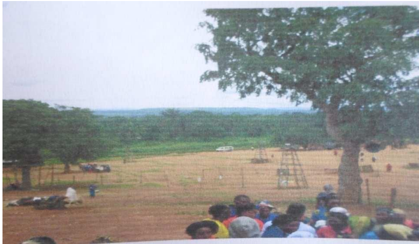
PLATE 4: OCAM Adoration ground.

These positive impacts notwithstanding, through the activities of this and other religious centres in Nigeria, the people have been so brainwashed that most people now believe that all sicknesses or illnesses are caused by wicked people (i.e. through witchcraft or poison, etc.). As a result, sicknesses that require medical treatment are left for the so-called 'prophets' or priests to pray for and with time the health of the individual continues to deteriorate, and eventually leads to death. This implies that people are no longer conscious of natural causes of illness and what one needs to do in order to remain healthy. Also, because they are assured of being prayed for, majority no longer believe that God answers prayers anytime and everywhere, and this informs why they troop to these religious/prayer houses. In addition, many ignorant tourists have been deceived, enslaved and extorted by some false prophets. There is decline in the prayer life of some of these pilgrims, i.e. they only pray when they are at the centre or when they are being prayed for by priests, and therefore do not engage in personal prayers. The adoration arena is an open space without shelter ( see plates ), seats and other facilities that will keep visitors comfortable. Thus, the visitors are usually exposed to severe cold during rainy period and may contract cold/pneumonia, which is a serious health issue.