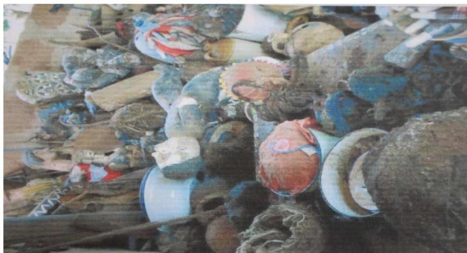
PLATE 2: Materials in OCAM mini-museum.

The ministry at the time of this research has a house for sick and mad people. They are kept there and prayed for until they receive their healing. This helps to lift the burden caused by sickness off the victims.