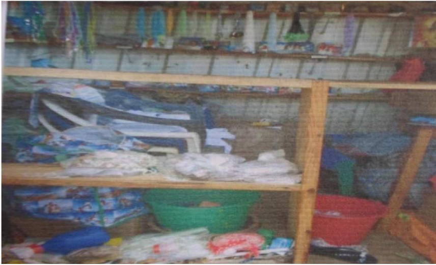
PLATE 1: Sacramentals on display in one of the shops at OCAM.

grouped as books, sacramental and music ( see plates ). On the other hand, the intangible resources include spiritual upliftment, healing, release from bondage and captivity, and blessings through the prayer ministrations.