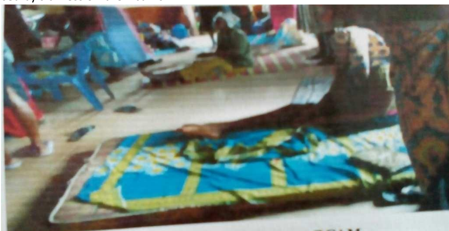
PLATE 3: Sick people waiting for healing at OCAM

The ministry at the time of this research has a house for sick and mad people. They are kept there and prayed for until they receive their healing. This helps to lift the burden caused by sickness off the victims.