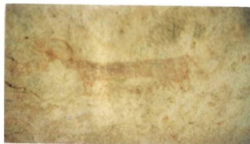
Plate 2: Painting in the the Agwaja rock shelter, Birnin Kudu showing a cow suckling a calf.