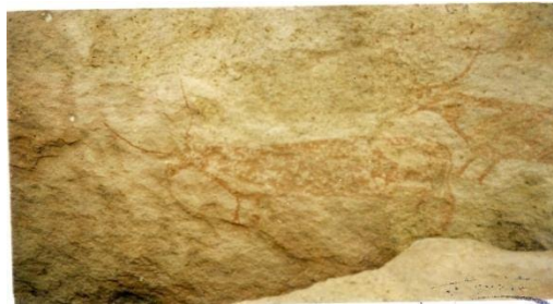
Plate 1: Painting of long-horned cows at the Habube rock shelter in the Birnin Kudu

At the Birnin Kudu site, three main styles of painting have also been identified. For example, there is superimposition at Dutsen Mesa, one of the sites, "so that a red outline (with black for part of a cow's back) underlying solid white, which is in turn overlain by solid red; red outline with white body also occur" (Shaw 1978:58). The Birnin Kudu paintings consist mainly of hump less cattle; both the long-horned and short-horned were represented and based on which Shaw (1978) argues that the Birnin Kudu cattle painting antedates the introduction of the humped cattle in northern Nigeria. He further suggests that it may be at least a thousand years old even though the paintings of the horse at Geji has been used to suggest that the paintings may not be earlier than the fifteenth century B.C. (Sasson 1960 cf Shaw 1978).