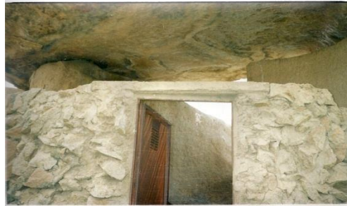
Plate 7: Entrance to the Agwaja rock shelter of Birnin Kudu where the painting is being destroyed.