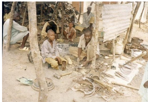
Plate 9: What is left of the blacksmith shop in Birnin Kudu