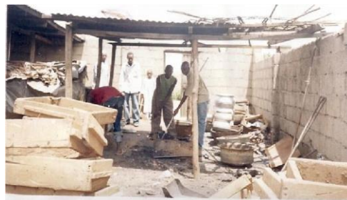
Plate 10: The surviving aluminum workshop at Birnin Kudu.