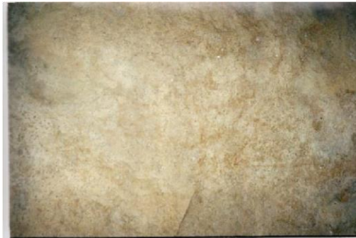
Plate 8: The fading painting of Agwaja cave in Birnin Kudu, where there has been deliberate scraping of the the paint for medicinal purposes.