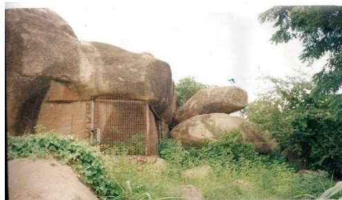
Plate 6: Entrance to the Dutsen Agwaja rock shelter, Birnin Kudu.