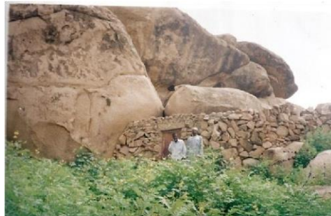
Plate 5: Entrance to the Dutsen Habube rock shelter at Birnin Kudu.