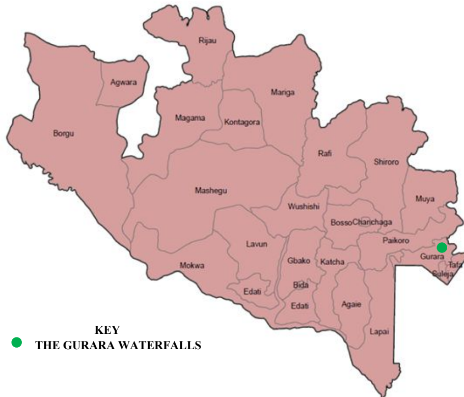
Figure 1: Map of Niger State Showing Gurara Waterfalls.