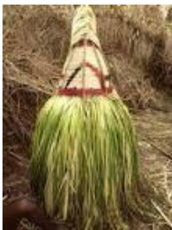
Plate 3: Odo masquerade

The Odo moves around the village silently and unseen by people, tracing not the normal village roads, but the traditional pathways of the ancient generations. It then departs to the land of the dead. The departure of Odo is often associated with ascending the hill or crossing the stream, and in Igbo mythology, hills and streams usually depict boundaries between the living and the dead. When Odo ascends the hill, it is usually escorted by male youths and spiritual persons (especially, titled men and chief priests), who would stop at a certain point and return to the village because they cannot follow Odo to the land of the dead, for that would amount to death. The Odo must proceed alone to the land of the spirit world. The departure of Odo is also accompanied by the disposal of cult materials used during the season, some are burnt and the more valuable ones stored away. In the past, conflicts and dangerous competitions in occultism amongst rival Odo units, who tried to prove their mettle by any means whatsoever, ensued as the Odo departs to the land of the spirits.