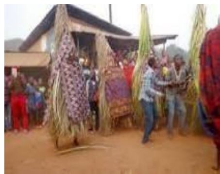
Plate 1: Odo mask made fresh palm fronds.